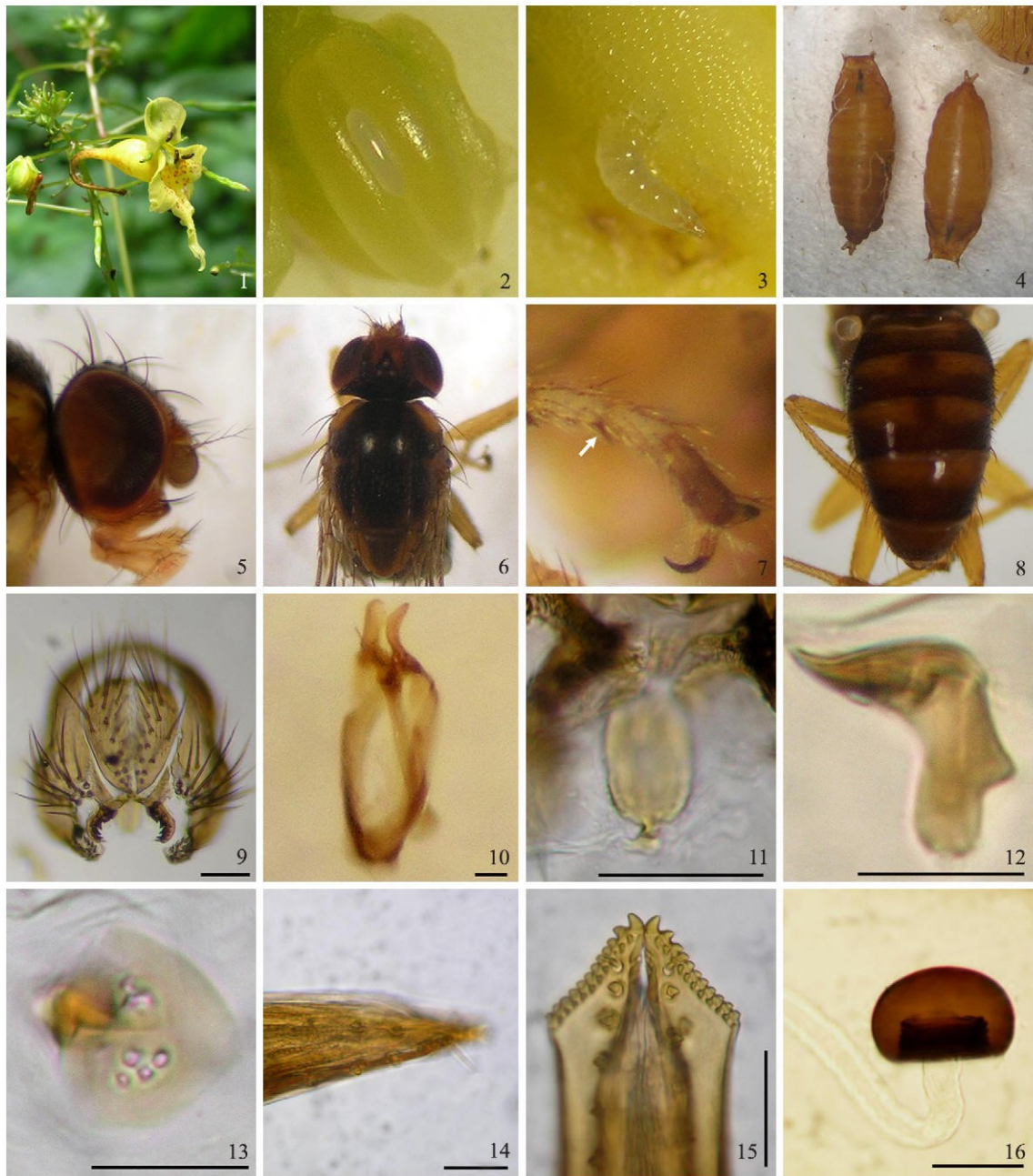
Figs 1 – 16. Hirtodrosophila yapingi sp. nov. 1. Adults gathering in- and outside the corolla of I. tayemonii flower. 2. An egg laid on the surface of the anthers of I. tayemonii flower bud. 3. Newly hatched larva digging the anther of I. tayemonii flower bud. 4. Pupae found in tissue paper in glass culture vials in laboratory. 5. Male head (lateral view). 6. Male head and thorax (dorsal view). 7. Mid leg showing dark spines on tarsal segments. 8. Male abdomen (dorsal view). 9. Peripheral organs (poster view). 10. Phallic organ (lateral view). 11. Decasternum (posteroventral view). 12. Ejaculatory apodeme (lateral view). 13. Ejaculatory apodeme (ventral view). 14. Apical part of oviscapt (lateral view). 15. Apical part of oviscapt (ventral view). 16. Spermatheca. Scale bars: 9 – 11, 14 – 16 = 0.05 mm, 12 – 13 = 0.025 mm.

long as the median one, but 0.72 (0.63 – 0.81) length of the posterior one.